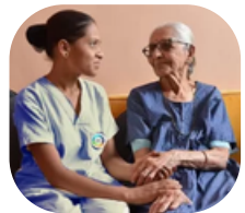
HOME TESTING SERVICES