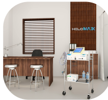
POINT OF CARE CENTER