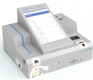
MULTI-PARAMETER TESTING DEVICE